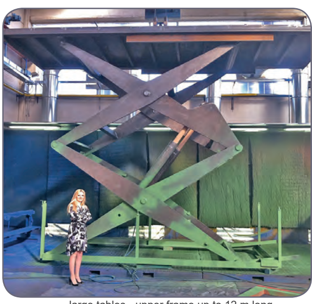
large tables - upper frame up to 12 m long