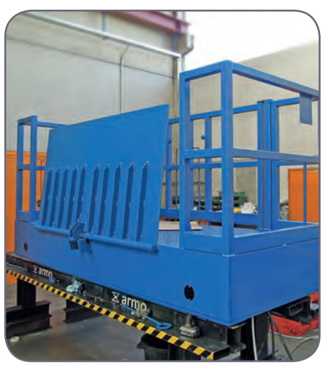
vehicle loading lift