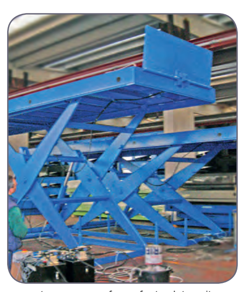
stronger upper frame for truck transit