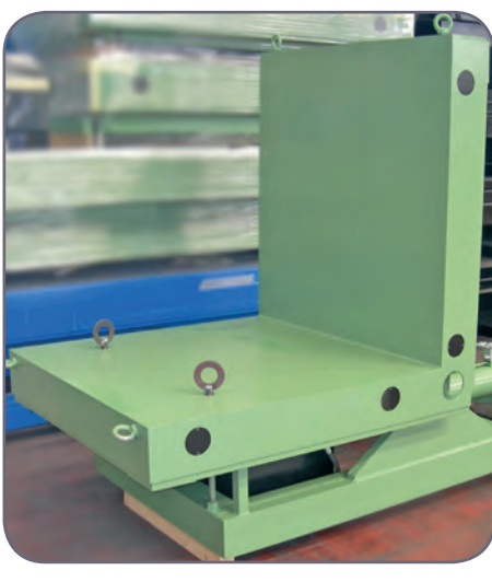
pallet tilting machine