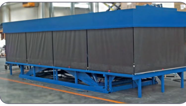
oversized lifting table with lateral curtains