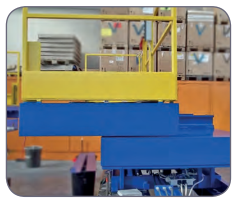
sliding upper frame