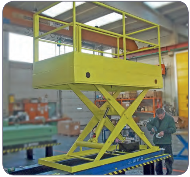
goods lift table with safety handrails