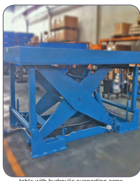
table with hydraulic supporting arms