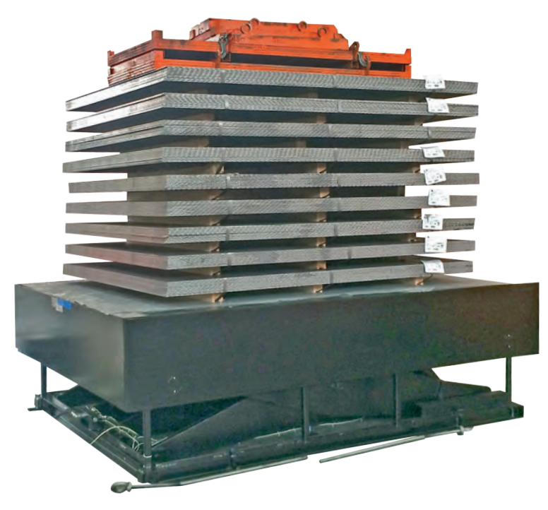
scissor tables up to 40.000 Kg capacity

Armo S.p.A. is a company with a well-tried international inclination, leader in the Italian market, the highest level of special care to its partners and their needs, providing a wide range of unique applications and specific, carefully finished products.