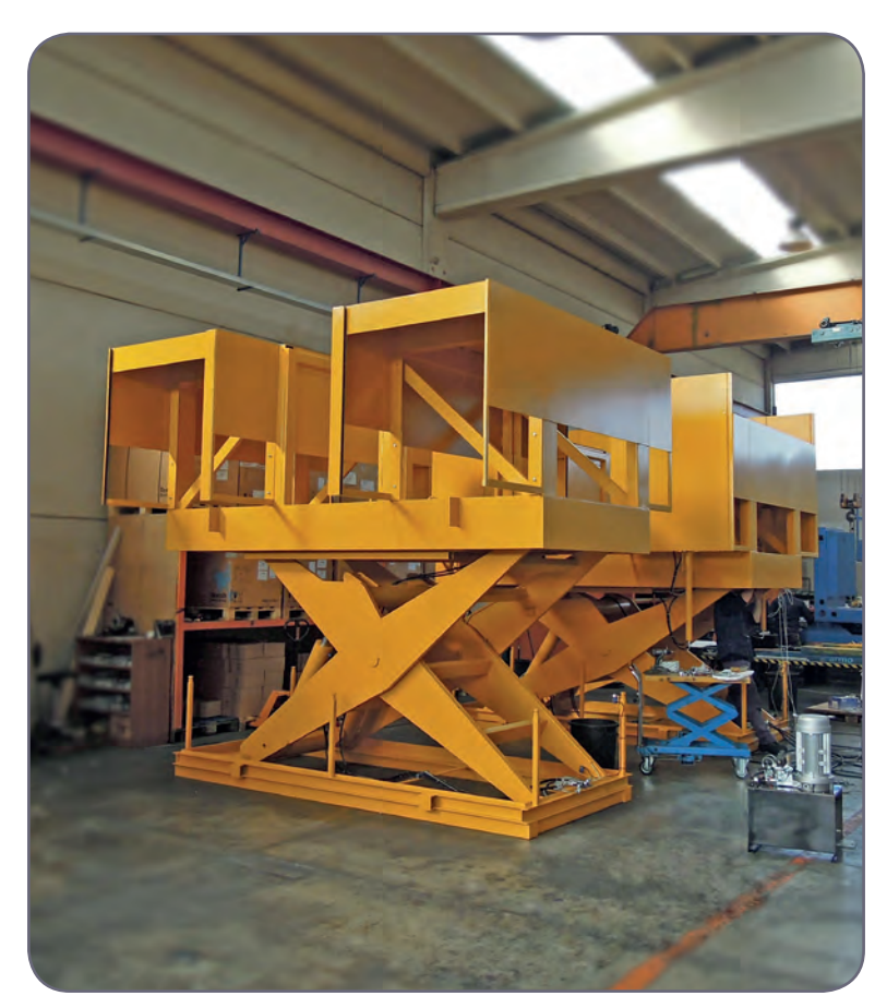
tailored carpentry for special manufacturing