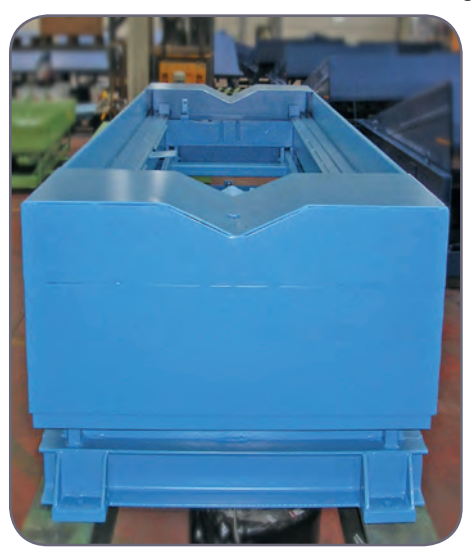
lift table with centering carriage