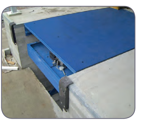
scissor lift integration with dock leveller