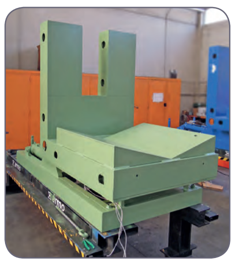
coils tilting machine