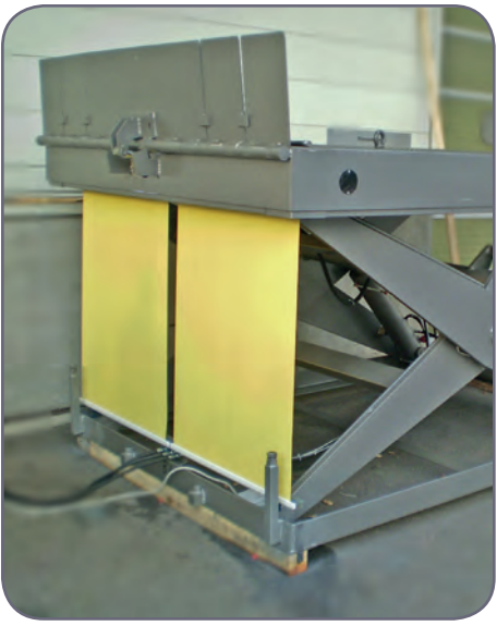
curtains and connection swing lip