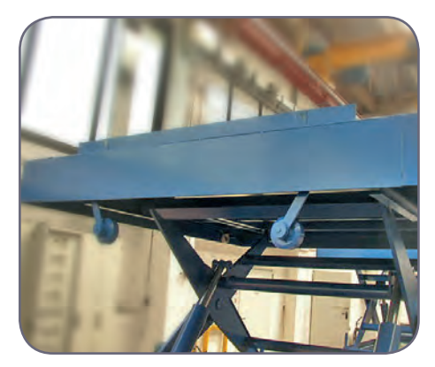
table with roll-off protection