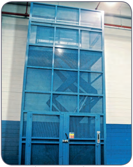
lift connecting two floors